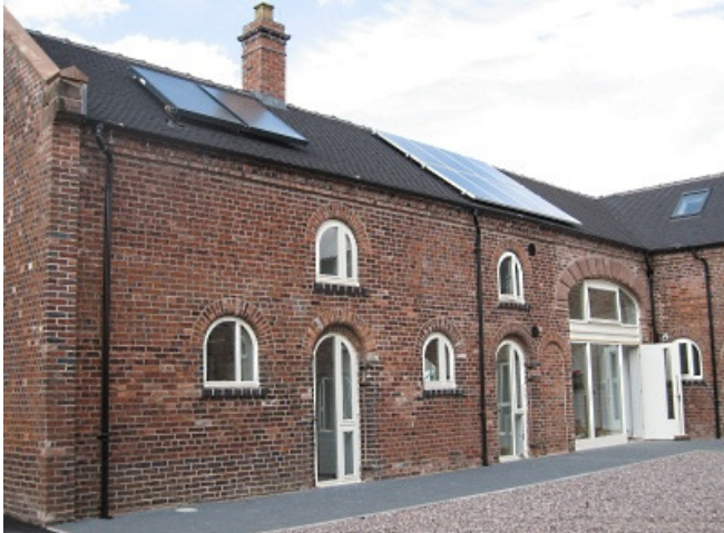
One of the Keele “Sustainability Hub” buildings, a converted barn

The “Keele Hub for Sustainability” building is a stunningly-converted farm at the entrance to the 650-acre Keele University campus near Newcastle under Lyme in North Staffordshire, dedicated to teaching and research in sustainable living ( www.keele.ac.uk/keelehub ).